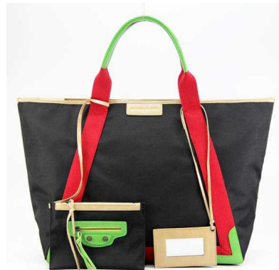
Original Quality Balenciaga Canvas Handbags-Black

Filter Results by: Displaying 1 to 17 (of 17 products)