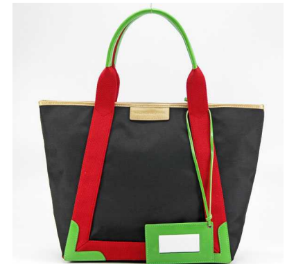
Original Quality Balenciaga Canvas Handbags-Black