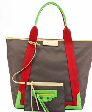
Original Quality Balenciaga Canvas Handbags-Coffee