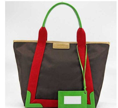
Original Quality Balenciaga Canvas Handbags-Coffee