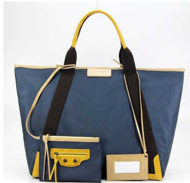
Original Quality Balenciaga Canvas Handbags-Dark Blue