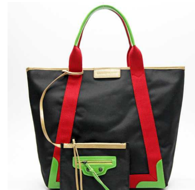
Original Quality Balenciaga Canvas Handbags-Black