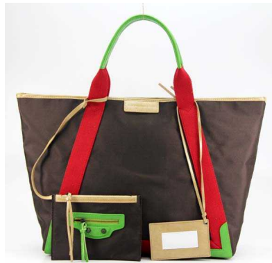
Original Quality Balenciaga Canvas Handbags-Coffee