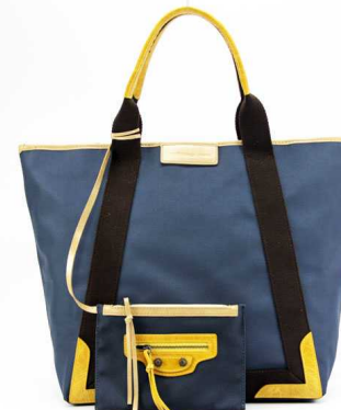
Original Quality Balenciaga Canvas Handbags-Dark Blue