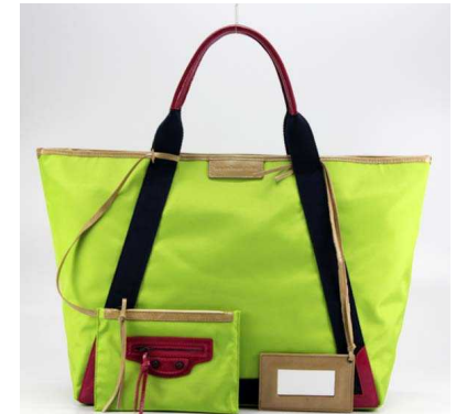
Original Quality Balenciaga Canvas Handbags-Green